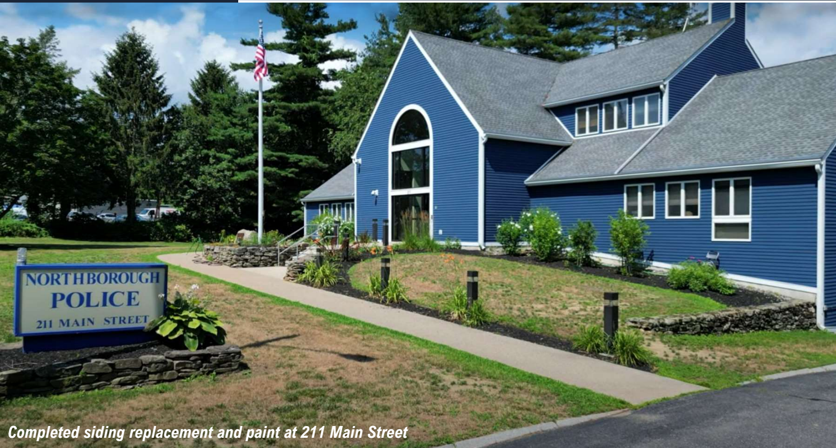
Completed siding replacement and paint at 211 Main Street