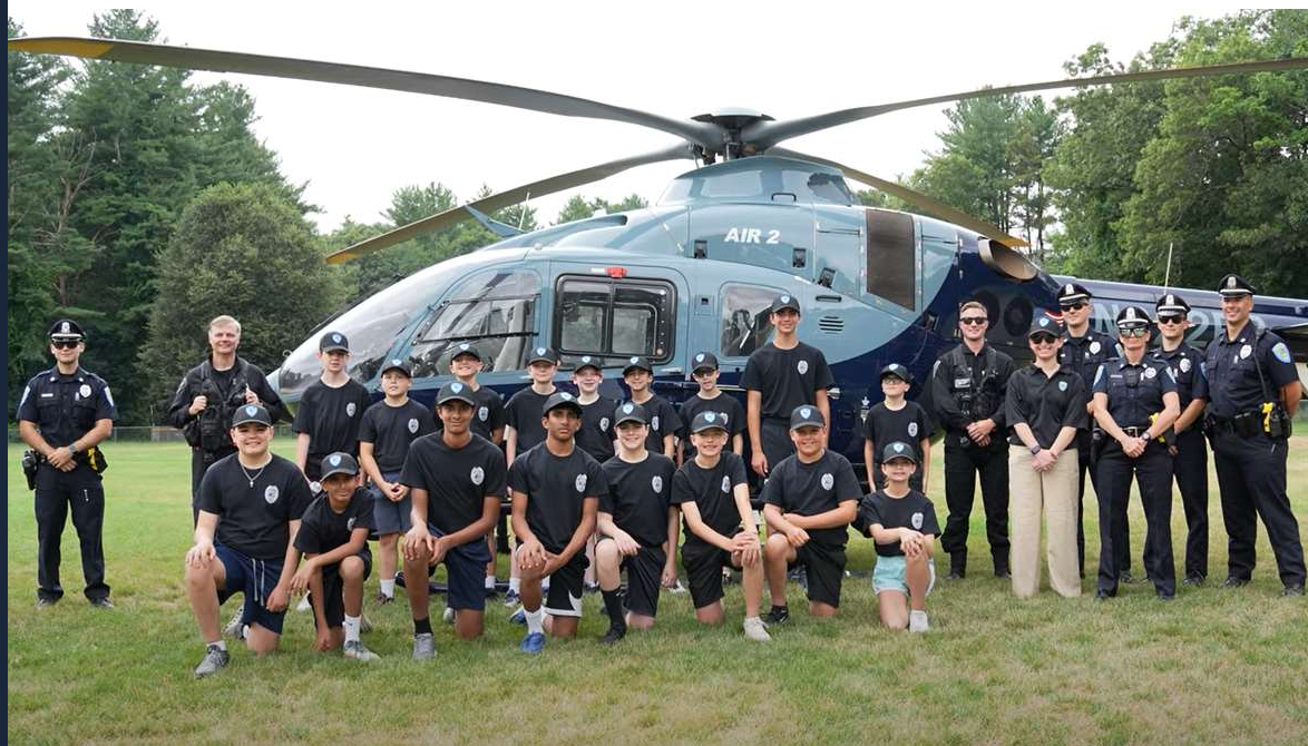
Youth Academy cadets and instructors with the MSP Air Wing

Significant incidents and department statistics for the month