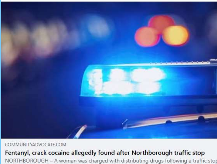
COMMUNITYADVOCATE.COM Fentanyl, crack cocaine allegedly found after Northborough traffic stop NORTHBOROUGH – A woman was charged with distributing drugs following a traffic stop.